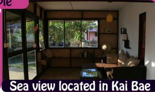
Sea view located in Kai Bae