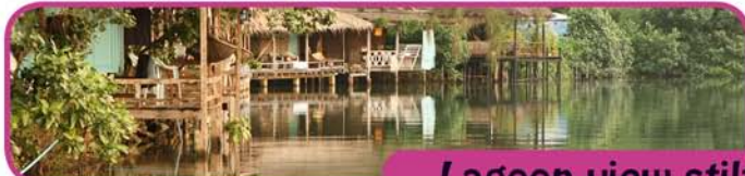
Lagoon view stilt bungalows